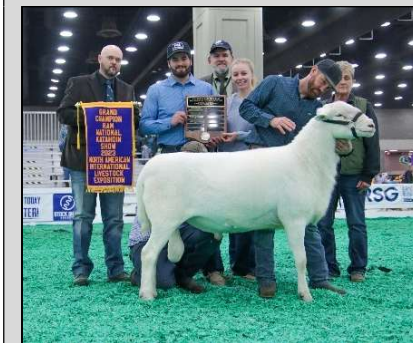
BMB 2204R "Momentum"

Raising Katahdins is part of our family farming operation. We focus on breeding sheep that will be great mothers and produce quality lambs. We utilize a pasture based management system. We've been fortunate to have winners at the county, state and national levels.