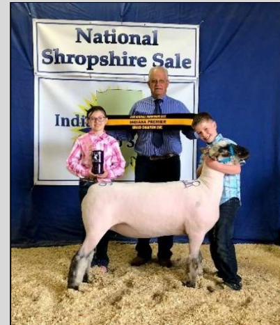
2022 National Sale Champion Ewe

Over a decade of successful line breeding. Sheep that we show and sell are competitive on multiple levels.