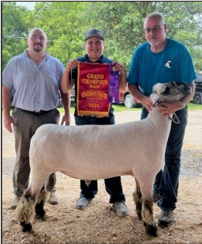
SS Shrops "Untouchable" sire of Fall Ewe Lamb.