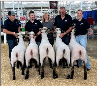
First place flock at the 2024 Iowa State Fair.

SS Shrops flock consists of around 30 ewes that we lamb between fall and winter. Our sires used have been SS Shrops "Untouchable" Supreme Champion at many shows. CLSF "No Fear" 2020 National Champion Ram and Double Doc 24-14, a Slack "On Tap" son. Our entire flock has tested RRNNFF. We strive to make great medium sized shrops!