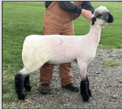
Apple 24-13, January Ewe Lamb from the 2024 Indiana Premier Sale, which sold to Kentucky for $1,300 (high selling Oxford).