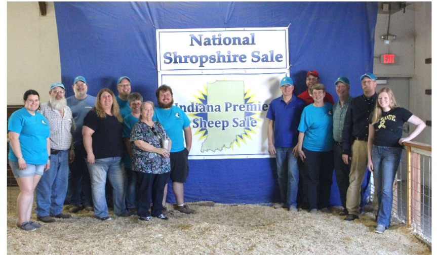
See you at the Indiana Premier Sheep Sale!

Winners announced at beginning of Shropshire sale!