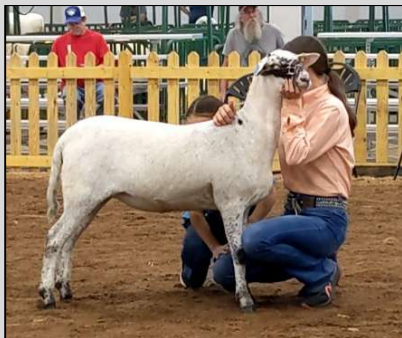
Champion ewe in the Jr. Show. Our consignments carry these genetics.

Good structure, great mothers, fall lambing genetics. These lambs will work for you on the farm and in the showing.